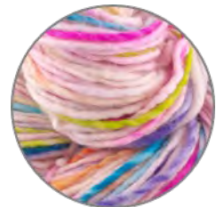
1276 Roberta Menchu

See www.roosteryarns.com for more colours in the Manos Serpentina range.