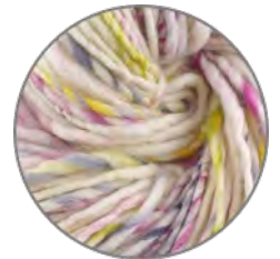
1565 Anne Frank