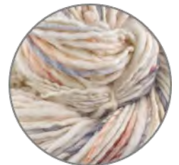
1683 Marie Curie